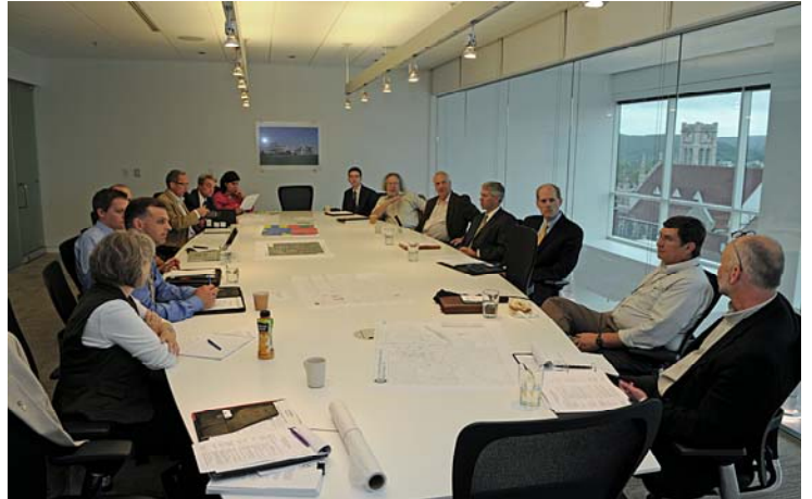
Chapter members met with City of Allentown and SDAT committee members on Day Two of the three day review.