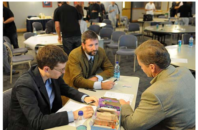
The judges ponder who will take home the (LEED Platinum) wrapped rice cakes.